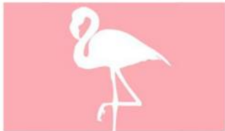
It's time for our monthly neighborhood social!

In order to continue having these monthly potlucks, we need volunteers to offer their yard or home. Hosting is easy! The Association provides paper goods and cutlery and neighbors bring a dish to share and whatever they like to drink. The host doesn't need to do anything — except provide the place!